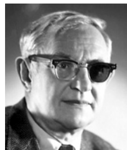
Dr. Julius Axelrod 1912 - 2004

In addition, ASPET will use the occasion of its centennial to debut what is hoped to be the first of the Julius Axelrod Symposia to be linked to the Julius Axelrod Award. This first symposium will feature four past winners of the Julius Axelrod Award.